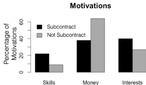
Figure 2. Overview of the motives crowd workers reported for their decisions to subcontract or not subcontract portions of the larger HIT. Sacrificing income was one of the main motives for not subcontracting.

These findings indicate that money was not the only factor in whether primary workers chose to complete subtasks