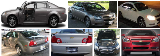
Figure 5. Examples of images for 2008-2010 Chevrolet Malibu sedan ls,lt,base,fleet showing intra class variation in our dataset. In addition to variations in color, background, lighting and pose, doors and trunks can be open or closed and cars can be occluded.

car (e.g. Honda vs. BMW). We know all nodes in one tree to be visually different from all nodes in a different tree. Under the make node is the model (e.g. 3 Series, 5 Series etc. for BMW). Under the model is the body type (e.g. sedan, wagon etc.) and manufactured year and trim (e.g. 330i, 335d, etc.). As noted earlier, nodes under one body type can look the same or different. Each type of car can be visualized as a leaf node in this tree.