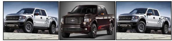
Figure 3. Unlike existing fine-grained image annotation methods, we cannot rely on taxonomy to group cars into visual categories. For instance, a 2011 Ford F-150 Supercrew HD (left) looks the same as a 2001 Ford F-150 Supercrew LL (right) but very different from a 2011 Ford F-150 Supercrew SVT (middle).

Our proposed workflow draws inspiration from prior work in decreasing image labeling cost through crowdsourcing while