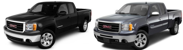
Figure 1. Fine-grained car categories look very similar to a non-expert. Here, a 2011 GMC Sierra-1500 extended cab sle (left) and a 2011 GMC Sierra-1500 extended cab work truck (right) look almost identical. However, the second car has a small opening on the metal bumper whereas the first one does not. Our fine-grained object grouping methodology correctly assigns these cars to different categories.

Existing large scale visual datasets, such as ImageNet, were constructed using crowdsourcing to label the object instances in images [5]. These objects range from animals like cats or dogs to synthetic artifacts like airplanes and cars. A worker