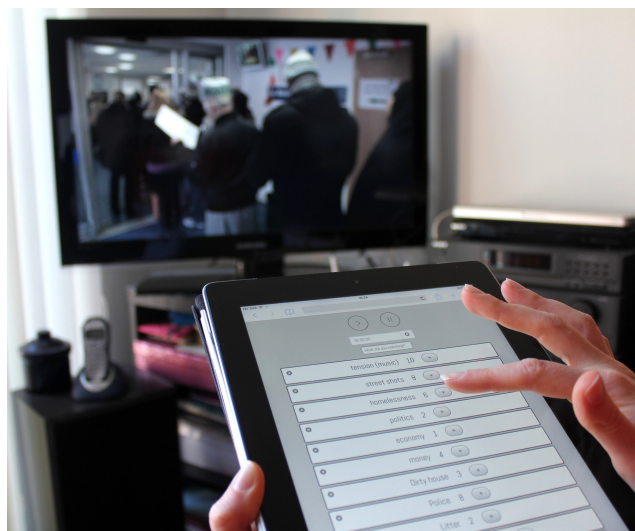
Figure 1. Mock-up of SG being used as a second-screen

to complete a “homework” exercise. These involved using SG whilst watching television. Participant experiences and the outcomes of their ‘spotting’ activities would then be discussed in the following workshop. Overall this formed three workshops, and two homework activities per group.