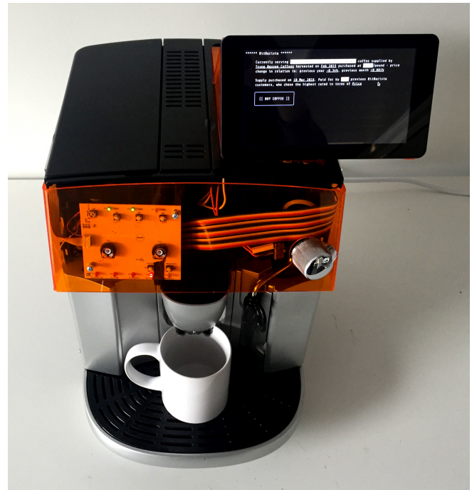
Figure 1. Bitbarista ready to serve a coffee

http://dx.doi.org/10.1145/3025453.3025878