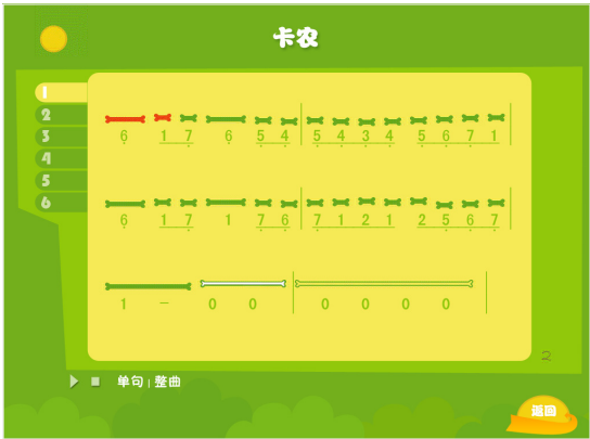
Figure 1. User interface of EnseWing.

rehearsal, we also added “practice phrase” and “practice whole song” buttons to strengthen the control of rehearsal.