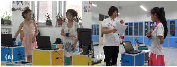
Figure 4. (a) Pair-wise practice. (b) Following the conductor.

various parts, which contrasts to not caring about other parts in the beginning of the study period. Throughout the class, the children's attitudes towards collaboration awareness changed significantly.