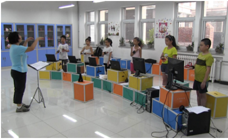
Figure 2. Setup of the class using EnseWing.

We analyzed all videos using a video coding tool, Datavyu[1] with two coders. One coder participated in the study, and the other was experienced in instrument performance and chorus. We conducted a 4-week coding cycle with the coding methods in [6, 11]. Every week, the two coders reviewed the videos of the same sessions, and then the coders and the researchers discussed and refined the codes. In the coding iterations, an important agreement among coders and researchers was that obtaining awareness and acquiring skills should be separated. In all, seven codes were collected from the videos, and three more codes were generated from similar iterative coding of the interviews. The constructed ten codes can be put into four categories: music awareness and skills, instrumental ensemble awareness and skills, collaboration, and overall experience (Table 2).