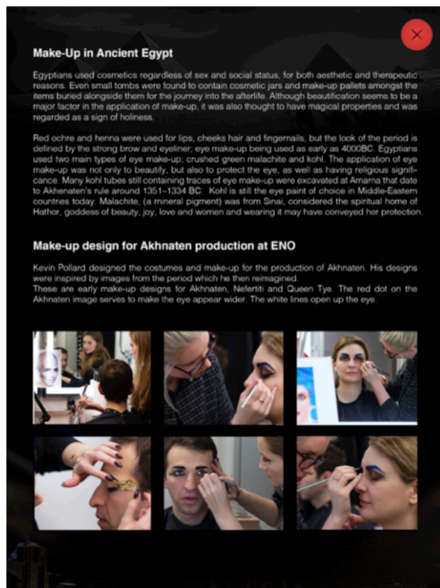
Figure 2: Info page that dropped down if an info button in the upper right corner of the virtual mirror was tapped

Table 1 outlines the differences between the four designs. Version 1 was designed to place the two looks automatically on the user when they sat or stood in front of the mirror, switching between them every 5 seconds.