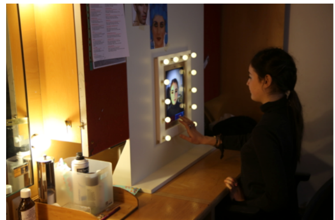
Figure 3: Framed AR mirror in the Opera dressing room

An observational study was conducted in the dressing room of the Opera House throughout the two-weeks when Akhnaten was on show. The researcher and the ENO education director were present, inviting people to see it in the context of an authentic dressing room.