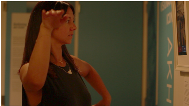
Figure 5: A museum visitor doing an Egyptian walk while interacting with the MagicFace

The groups often separated while in the museum to look separately at the various exhibits. When one of them came across the MagicFace by themselves, they would call out to their companion/s for them to also try using the mirror. Others would call back to their friends to return if they have not tried both looks, for example: “ Come back, you haven’t tried the other look, you haven’t tried the Nefertiti. ” There were no signs of social embarrassment when the visitors were using the MagicFace when visiting with others. Instead, there was much evidence of enjoyment, as they commented on each other’s looks, chatted while using the mirror and discussed how the technology worked.