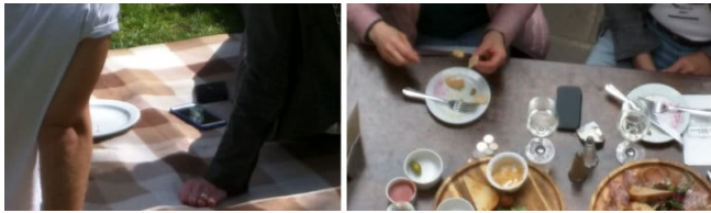
Figure 5. Opportunities for a camouflaging mobile device. Left: a phone laid on a checkered picnic rug. Right: a phone on a cluttered restaurant table. Both photos were captured in situ during our observational study.

Turning to the Chameleon Phone’s subtle notification cues, in general, participants saw the potential for subtle but informative messages. Several groups also suggested options for what the flashing colours could mean: “I would mostly use the yellow colour for incoming SMS messages. I could set different colours for different close friends” . Similarly, one participant wanted to always associate the same colour with a particular person, whereas another wanted a specific action to happen when a service provider was calling so they could avoid answering unwanted calls. Participants also liked the glowing feature in particular, prompting comments such as, “eyes are fast – in the corner of my eye I can see something glowing” .