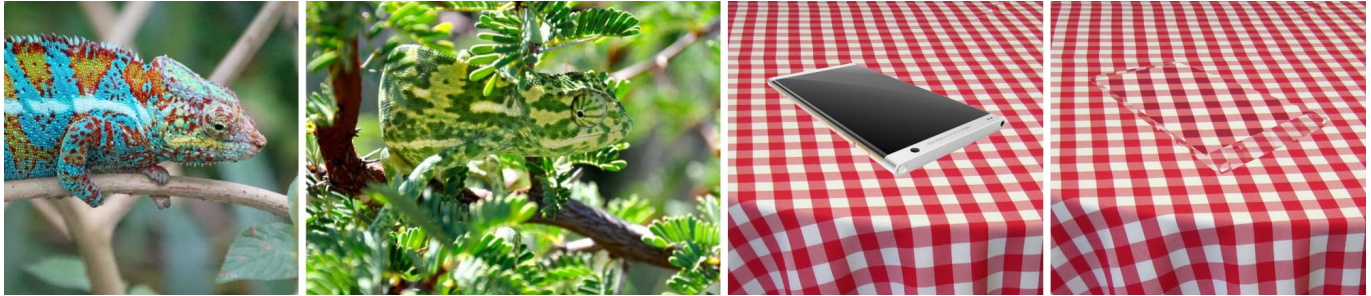
Figure 1. Chameleons are well known for their ability to change the colour of their skin for survival and social signalling [10]. Sometimes this colour change is to indicate aggression towards other animals, or in response to temperature or mood (left); at other times, as in the centre left image shown here, chameleons can match the pattern of their surroundings near perfectly, perhaps to lessen the danger from predators. In this work, we explore how mobile devices might be able to perform the same feat. The centre right image, then, shows a phone placed normally on a table. At right: the same phone blended in to its surroundings, but still able to present social signals to its owner in a subtle manner.

3 Interact Lab University of Sussex, UK { d.sahoo, sriram } @sussex.ac.uk