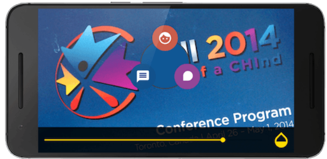
Figure 6. Interaction with the deployed Chameleon Phone prototype. After taking a photo of a surface, the app automatically zooms the image as the user sets down the phone (the user can then pan or zoom the display for perfect alignment). The app automatically assigns the three main colours found in the image to Facebook, SMS and WhatsApp notifications. If desired, the user can select their own choices via a colour loupe (the popup shown in the centre of the screen), or adjust the brightness of the image to more closely match the surrounding surface (slider at bottom). When a notification is received from one of the three linked apps, the corresponding colour in the image will glow, as shown in Fig. 3.

To further evaluate the chameleon notion, we wanted to explore how the concept resonated with users in a more natural environment, providing further use-case scenarios and improvements to the updated prototype design. With this in mind, we deployed the second version of the Chameleon Phone prototype over a period of five-weeks in each of four locations. Three of these regions were where we knew safety and security was an issue for local residents; that is, people drawn from communities in Langa, South Africa; Nairobi, Kenya; and, Mumbai, India. In addition, we also deployed it to the 10 UK participants described in the previous section.