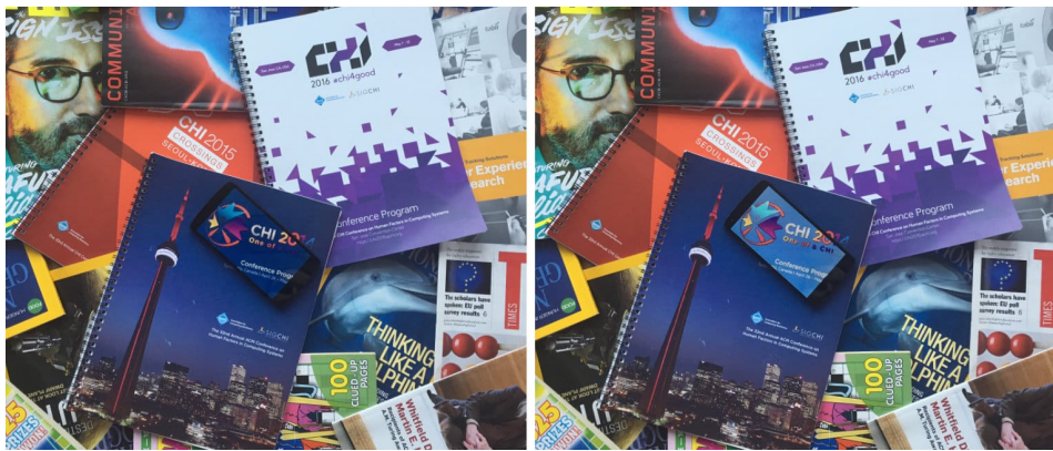
Figure 3. Optically camouflaged mobiles: hiding in plain sight on everyday objects.

Left: the Chameleon Phone probe “camouflaged” on a patterned surface. While the outer fascia of the phone is still visible, the screen displays an exact replica of the object underneath.