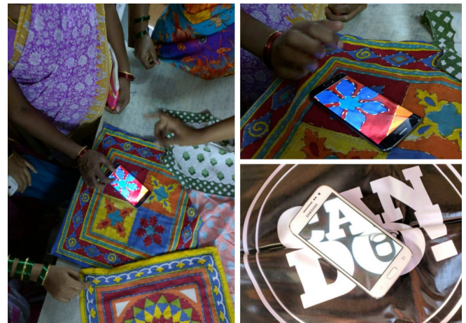
Figure 4. The initial Chameleon Phone probe in use by participants in the studies in Dharavi (left and top right) and Langa (bottom right).

Six months after the future mobile design workshops, we carried out two further workshops with participants in Langa (Cape Town) and Dharavi (an informal settlement in Mumbai) to focus specifically on chameleon-like opportunities. We recruited 16 participants in each location (32 people in total – 15F, 17M, aged 18–50) to take part. Participants lived in communities the same as (in the case of Langa) or similar to (Dharavi) participants in the first workshops. None of the participants had taken part in the previous studies.