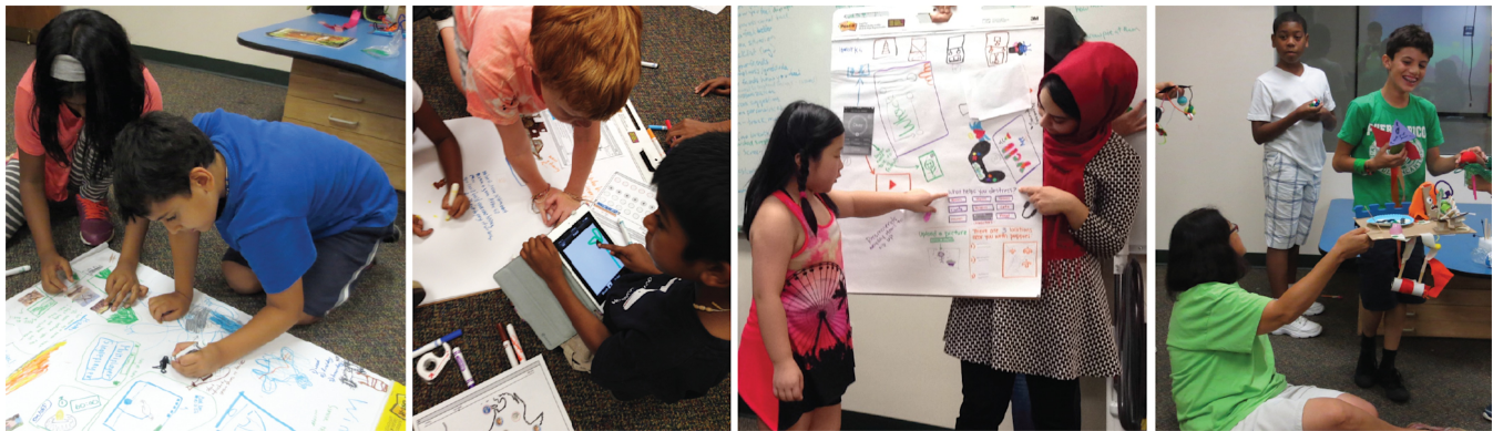
Figure 1. Adults and children working together on a PD team to prototype children’s technologies. Far left: Paper prototyping a web-based survival game. Middle left: Using mobile devices and paper mockups to iterate a history game. Middle right: Presenting paper mockup ideas for a mobile mental health application. Far right: Presenting 3D prototyped ideas for a virtual reality game.

{bmcnally, mattm401, mguha, allisond}@umd.edu