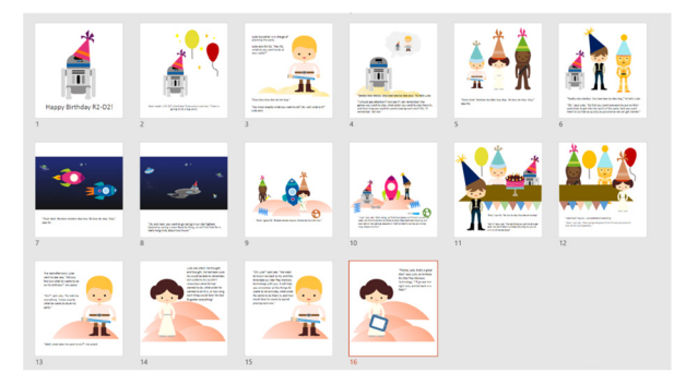
Figure 1: Storyboard for "Happy Birthday R2D2," our fictional inquiry storyline. R2D2 plans the play activities for his birthday party. When Luke tries to relay this information to Leia, he forgets the details and uses an app to recall the plan.

After children completed these sketches, they participated in 3 different comicboarding exercises (e.g., Figure 2). Each comicboard was designed with panel-style scaffolding [24], such that the comic was complete except for a single missing panel for children to fill in. The comicboards extended the storyline of our fictional inquiry and brought in elements of planning that were not probed in the original story. When a child was ready, a facilitator read the comicboard out loud with the child, along with a prompt at the bottom of the page explaining the missing panel. Children sat with their age-defined group as they sketched but worked individually.