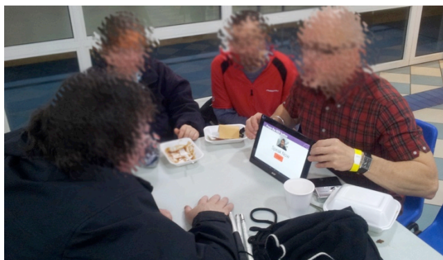
Figure 2. Finding opportunities to use ThoughtCloud in the café of an exhibition centre at an annual event.