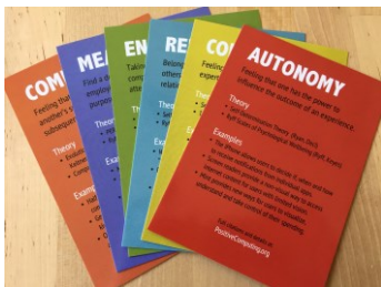
Figure 2 – Wellbeing Determinant Cards - Used to guide ideation around wellbeing impact.