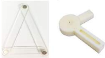
Figure 1. Initial prototypes include both fixed system (left), and extendable system (right).

over seven years' experience teaching visually impaired children. To get the most value from this session we finalized initial design decisions in order to present a high-level candidate system prototype for discussion. We prepared simple physical mockups of a strut based construction kit that would enable users to snap together a range of simple geometric shapes. We opted to use a standard tablet computer and capacitive markers as the tracking system [2]. At this stage our system was neither functional, nor fully designed and the goal of preparing these materials was to better solicit critique and comments.