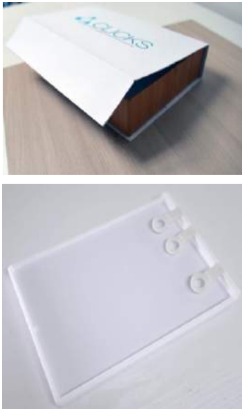
Figure 4. Clicks packaging (top), and initial design for tablet holding plate (bottom)