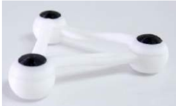
Figure 2. Clicks working prototype. Three pieces joined together

connected to another. Third, the design should have a clear top and bottom, so that it can be unambiguously assembled. These three properties are intended to make using the prototype as simple as possible. Finally, we should maximize the angles at which two components can be connected together. This allows Clicks to support creation of a wide range of geometric forms. The final forms are illustrated in Figure 2. Each object is composed of a base assembly connected by a strut to a top assembly. Objects are joined by connecting bases to tops. The strut that connects the base to the top is slanted upwards to maximize the angles at which two components can be connected.