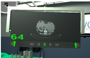
Figure 5: Interfaces for the foot gestures.