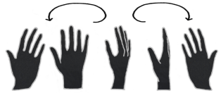
Figure 4: The hand gesture.