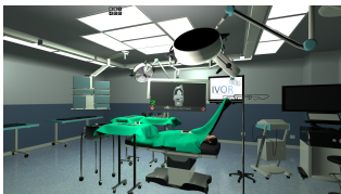
Figure 2: Screenshot of inside IVOR. You can see the operating table with a dummy patient covered in green cloth and various tables with surgical tools. Surgical lights, monitors and a cupboard rack are mounted to the ceiling and walls.

the other developed SimMed, a tool to train medical students on a simulated, life-sized patient displayed on a large touch-screen [28]. King et al. [12] used VR to view medical images and showed that there is no significant difference in accuracy.