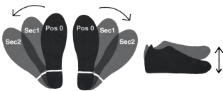
Figure 6: The foot gesture.