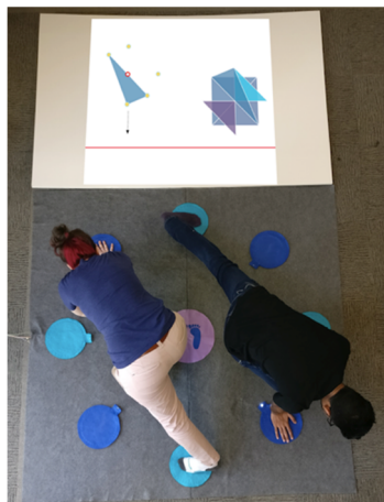
Figure 1. As a shape descends from the top of the projection area, players recreate the shape with their bodies on the interactive mat.

Geometry has been recognized as a fundamental pillar of mathematics [11]. The Common Core State