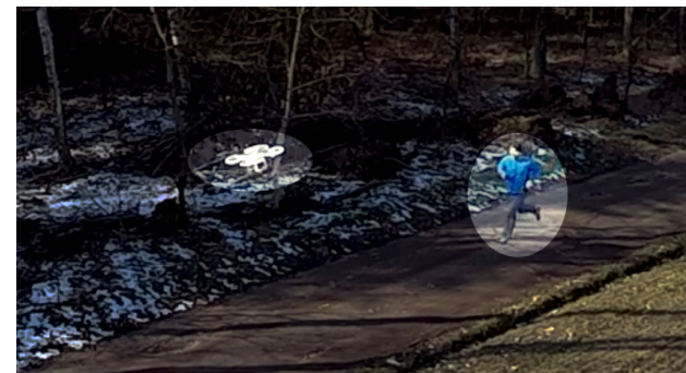
Figure 3: A drone following a runner and transmitting the current race view to the runner's supporters.

During the course of the race, supporters were provided with access to the drone (DJI Phantom 3) at chosen points of the race route. Those locations were chosen to maximise the view from the drone and the number of possible interactions with runners. The group gathered at the start of the race and once the runners started running, we transferred the supporters to a chosen location on the course of the race, where they could control the drone. A skilled drone pilot was available at all times and the participants took turns in controlling the drone. Additionally, researchers were posted at 'lookouts', observing the race in stages before the view range of the drone in order to warn the drone operator when the participating runners would enter the