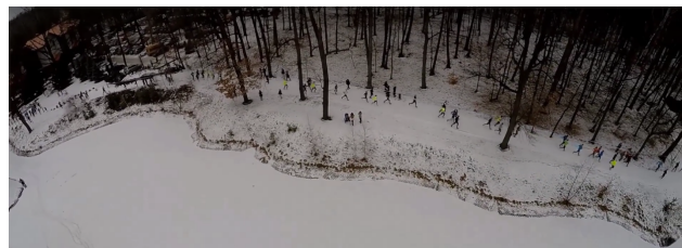
Figure 2: Video footage obtained from a drone hovering over the main race area, showing participants in a winter obstacle course race running through the snow.