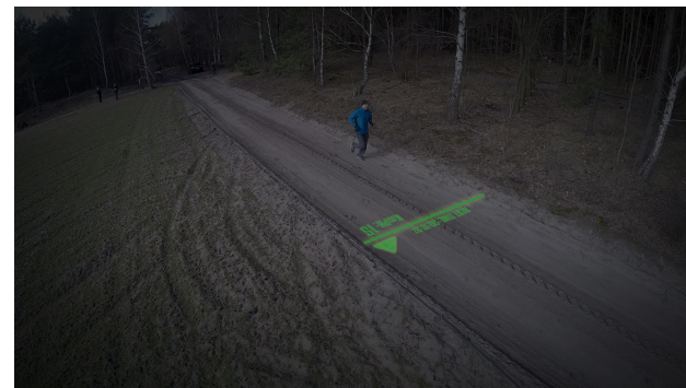
Figure 4: A possible future scenario where a drone provides visual projection feedback during a race.

Another runner reported that the drone made them think about those controlling it and viewing the video feed: