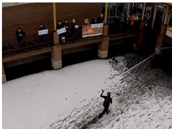
Figure 1: Users communicating during co-located cheering in a race. The footage recorded using the drone enabled users to recall those moments and the role of cheering in race performance.

ner's body. We investigate a scenario where the cheering comes for the environments of the run — just as in traditional co-located cheering.