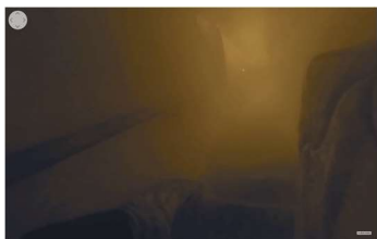
Figure 5: In this scene, the video switches to a first person POV of a gloved hand reaching through the smoke. The viewer can navigate as “their” hand attempts to remove debris and reaches to the staircase banister.