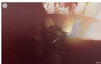
Figure 6: In this scene, the POV switches to another firefighter, Anthony, getting stuck at the debris at the staircase. The viewer can navigate to see Anthony struggling while the flames envelope the area.

highest immersion score, followed by GC without headphones, MW with headphones, and then MW without headphones. We predicted that GC would be more immersive than MW because it takes up the users’ field of vision, allowing the person to concentrate more on the story and not to be distracted by their environment. Similarly, headphones (+) would be better than no headphones (-) because headphones block out distracting sounds from the environment.