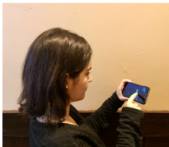
Figure 1: Magic window on mobile phone. The viewer moves smartphone or taps with finger to navigate.