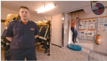
Figure 8: Some participants did not notice the other firefighters sliding down the pole. A hotspot (top right of figure) could help to direct the viewer's attention so that they turn to the right in time to see it.