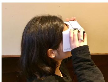
Figure 2: Head-mounted display using mobile phone. The viewer moves head and/or body to navigate.