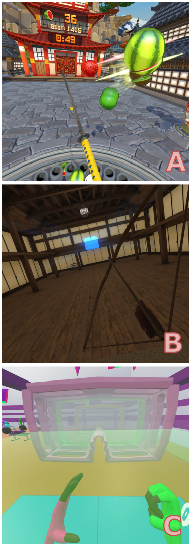
Figure 1. Screenshots of games: (A) Fruit Ninja, (B) Holopoint and (C) Hot Squat