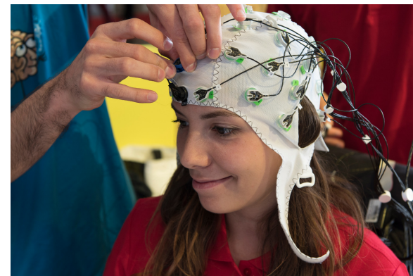
Figure 2: An electroencephalography (EEG) cap.

In order to mitigate the misconceptions surrounding EEG and BCI, we introduced Teegi in [2], as a new system based on a unique combination of spatial augmented reality, tangible interaction and real-time neurotechnologies. With Teegi, a user can visualize and analyze his or her own brain activity in real-time, on a tangible character that can be easily manipulated, and with which it is possible to interact.