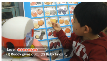
Figure 2 Play Board Game