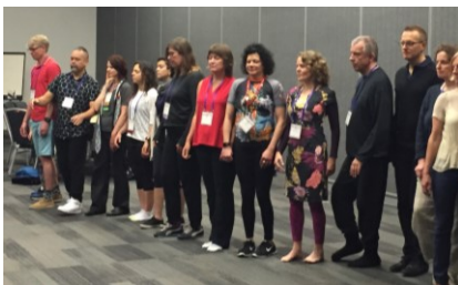
Figure 1 Pictures from CHI 2016 workshop