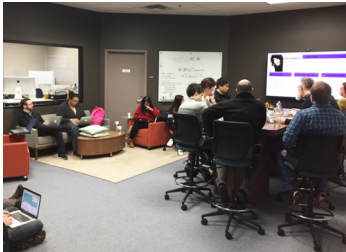
Figure 2: Team members gather around a large screen to share the 1-3 personas they created at the end of the party.

targeted learner audience for the Finance for Everyone MOOC.