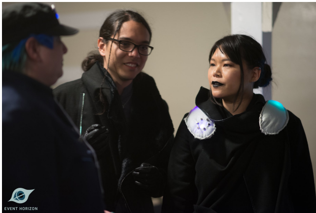
Figure 2: The wearer on the right has their device color display Immunity mode.®Event Horizon.

overload together in a dramatic scene involving augmented strength "we decided if we did that [using their skill] we were immediately supposed to trigger an overload" (I16).