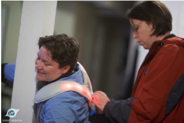
Figure 3: The wearer on the right has their device color display Immunity mode.®Event Horizon.

interactions. Far from being perceived as a burden to players, vulnerability was understood a source for meaningful personal and social experiences.