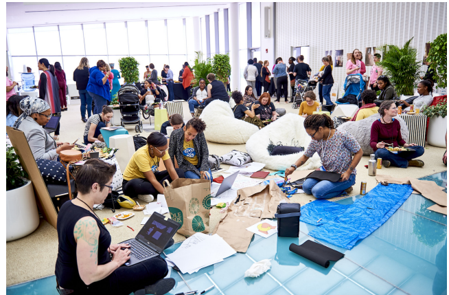
Figure 2: Participants of the hackathon gathering in temporary rooms, using them as sites for discussion and creation.

Providing opportunities for beginners to learn how to use new tools and materials was a key goal of the hackathon. All areas were staffed by volunteers versed in the various technologies, and all tools were labeled so participants who had never previously encountered them would know what they were called. For many participants, this was the first time they had ever seen a 3D printer in action, and volunteers from Formlabs demoed the technology the entire weekend. Additionally, to demystify the inner workings of the breast pump itself, a volunteer created a 3D "exploded view" of a