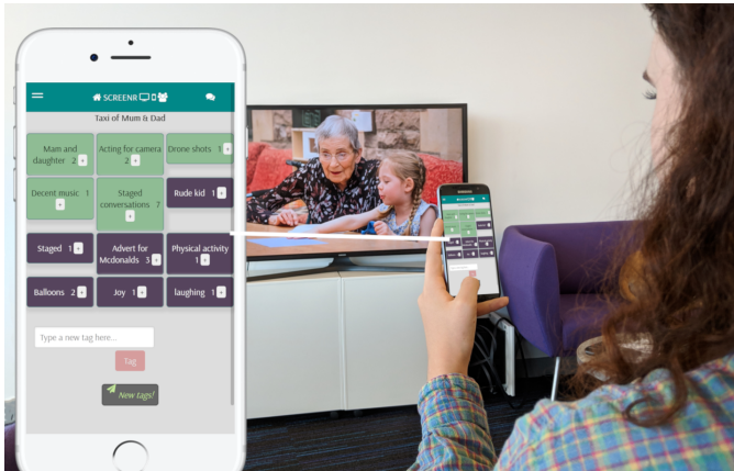
Figure 1: Screenr usage in the home

commentary on people appearing in the show. Indeed, Scarborough and McCoy [23] suggested that viewers who report more moral (and, by implication, more ‘critical’) reactions to reality TV were less likely to actually watch it. Coupled with the essentially negative portrayals reality TV deals in, the tendency for reality TV to produce uncritical viewings in the majority of its audience is problematic. Given reality TV’s primary purpose as entertainment, we are motivated by the previous work of Tremlett [25] who has noted how uncritical viewings of reality TV shows often accentuate the differences between the viewer and those on screen, leading to the entrenching of negative stereotypes and stigmatisation. In this way, reality TV can serve to undermine the lives of those that it claims to document, and problematically provides justification for their ongoing ‘othering’ and stigmatisation.