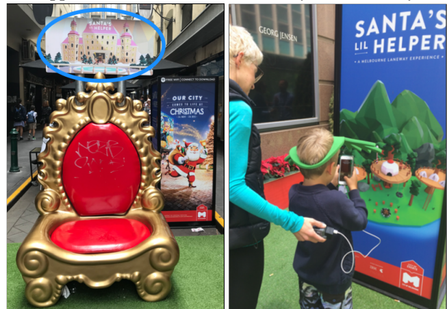
(c) The signpost marker (circled) used at the Degraeves Street laneway. (d) A family using Santa’s Lil Helper at the Alfred Place location marker.