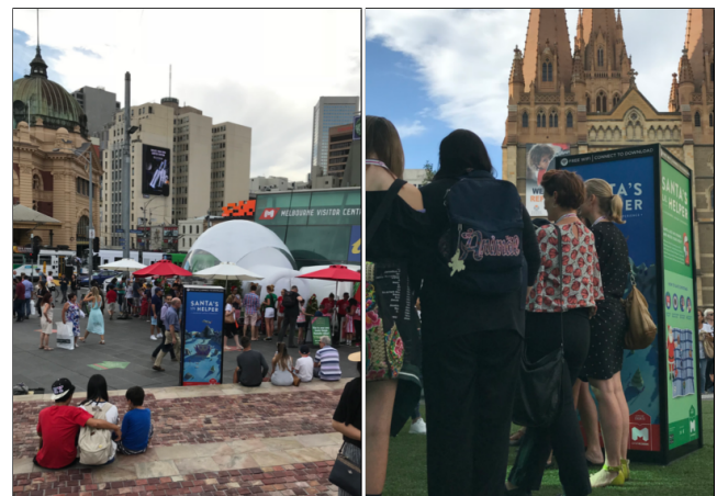
(c) A marker positioned at Federation Square.