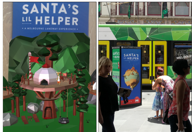
(a) An example of an AR scene revealed through interaction with an SLH marker.

First-hand experience is good practice when studying games since it allows researchers to understand how the game works while supporting the interpretation of findings [42, 58]. In our case, all members of the research team downloaded SLH after its release and individually visited the marker sites to explore the game's content. This provided an appreciation of the game's functionality and a grounded understanding of the sites in which it was played.