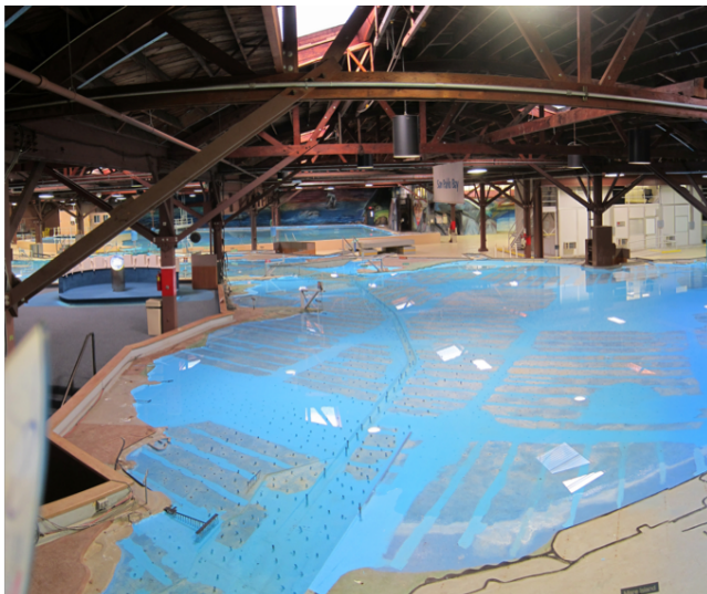
Figure 2: The Bay Model

radical reshaping of the region's ecological and infrastructural landscapes. His plan included damming the major rivers that flow into the Bay, constructing massive causeways that would separate the north and south reaches of the Bay from the Pacific Ocean, the infill of over 80 square kilometers of the bay's shallow marshes and mudflats, and a major expansion of development and industrial and military installments focused on the central Bay. To assess the impacts of "the Reber Plan", the US Army Corps of Engineers constructed an enormous 320 by 400 foot working hydrologic model of 1600 square miles of the San Francisco Bay and surrounding deltas. The model draws 135,000 gallons of water per day through its channels, canals, and rivers, simulating the interplay between hydrology, the physical landscape, and the built environment of the region. It helped show that Reber's ideas were unfeasible, and although the Plan was scrapped by the early 1960's, the Bay Model is still functional and open to tourists and school trips. A small exhibit on geographic information systems (GIS) reminds visitors that engineers and scientists now develop these kinds of models every day on laptop computers with greater ease and precision.