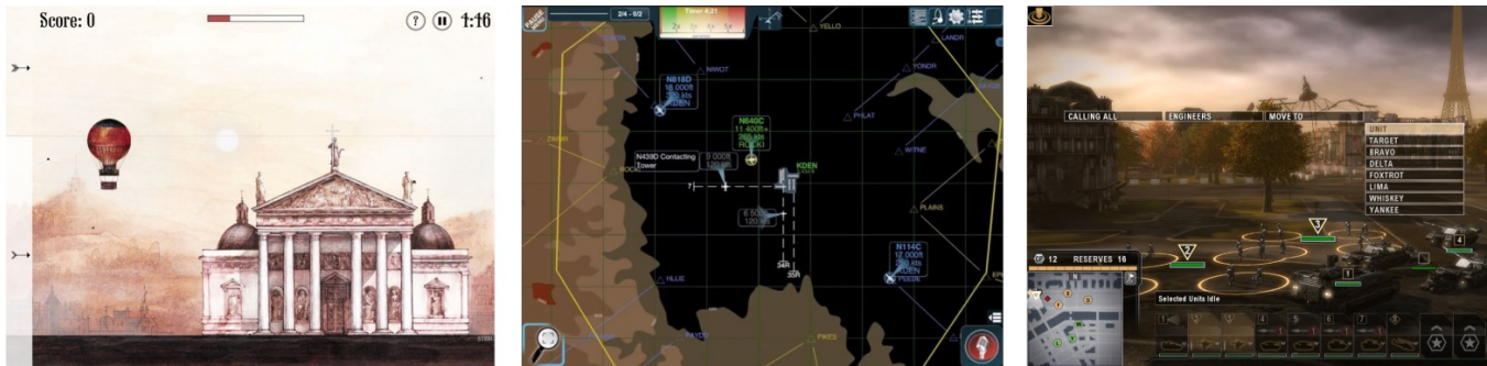
Figure 1: Selected games: The Howler (left), Air Traffic Control Voice (middle) and Tom Clancy's EndWar (right).