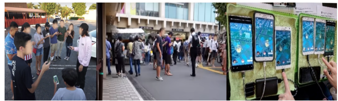
Figure 2: Left: Raids in US (people in a group facing each other) Center: Raids in Japan (people raiding in a crowded area but not facing each other) Right: Trays with six smartphones used by two players for raiding in Pokémon GO using separate accounts and devices.

4.2.3 Cultural and Individual Differences in Social Interactions During Raiding. Participants raided with family members (e.g., spouses/significant others ( n = 69 ), siblings ( n = 18 ), and parents ( n = 15 )), but mostly with strangers. The raiding format facilitates 5-15 minutes where people are co-present IRL and can have face-to-face interactions while raiding on their phones. Most conversations happened before or after the raid battle, but the simple game controls also allow groups to converse during raiding. Thirty participants reported having no social interactions while raiding IRL. Others reported four main types of social interactions: