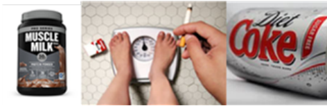
Figure 3: Popular diet/food media

Diet & Food. Food and beverage play a central and fundamental role in any given ED. Unlike the previous study, the diet and food tags did not display examples of fruits, vegetables, or portioned meals. We observed a focus on protein and protein supplements used for building muscle mass as well as diet drinks and cigarettes as means to suppress the urge to eat. Figure 3 highlights media related to these descriptions.