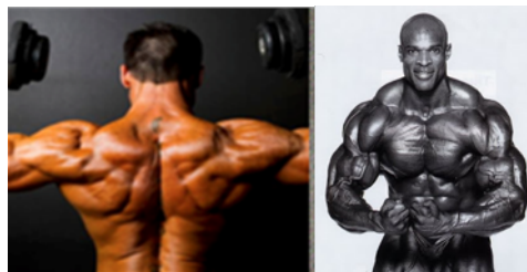
Figure 1: Examples of malethinspo

Our analysis of the dataset validated the archetypes found in the previous study while identifying new archetypes not found in the previous study. The archetypes described below