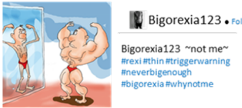
Figure 4: Denial of ED Behaviors example

we will elaborate and describe these differences and discuss why these differences matter to HCI.