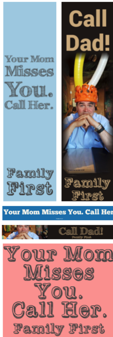
Figure 1: Example of auto-generated family ads in a few of the IAB standard sizes.