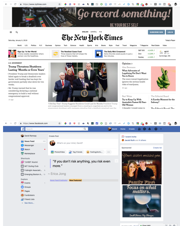
Figure 6: Ads inserted into NYTimes and Facebook through the Chrome Browser using YourAd.

of (1) overt– but user-aligned– persuasion attempts (like the pairing ads), (2) personal ad imagery (i.e. a generic image of a book you have vs. a picture of your copy taken on your counter), and (3) user-driven ad design (the ad creation process frames future ad interaction vs. similar ads that preserve surprise and authoritative distance).