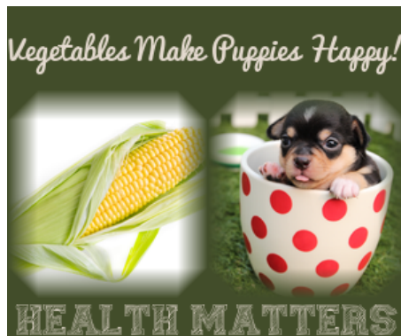
Figure 3: Example of auto-generated pair ads, where ‘promoted’ things are paired with surprising happy photos, and negative things are paired with the opposite.

Ads also shape our emotional responses to a given brand. This is accomplished in myriad ways, including social techniques like identity priming , authority bias or physical attractiveness stereotype , as well as with simple pairing/association which take advantage of attribution bias . We can exploit appeals to identity, authority, and positive/negative pairings in YourAd to help shape our own view of certain products and behaviors.