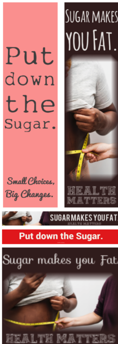
Figure 2: Example of auto-generated sugar ads in a few of the IAB standard sizes.

easily by Click Through Rate (CTR), or in creating brand awareness/affinity, measured through brand recall. Most of the accumulated influence of these micro-interactions on our decision-making can be attributed to simple cognitive biases due to the limitations of the format.