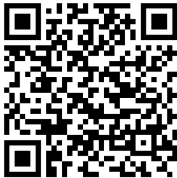
Figure 4: QRCode link to Hyper Typer on the Google Play Store [16]

Following the successful pilot test, Hyper Typer was released publicly on July 13th, 2018. Between its release and October 1st, 2018, 893 games were played on 275 distinct installations. Of those 275 installations, only 47 reached a final score higher than 0 points in 504 games. 6 games were interrupted and later resumed and therefore excluded from the results. To remove garbage input, transcribed phrases with an individual score of 0 were also filtered out. This results in a total of 1,917 usable transcribed phrases with 58,829 keyboard input events (Table 1).