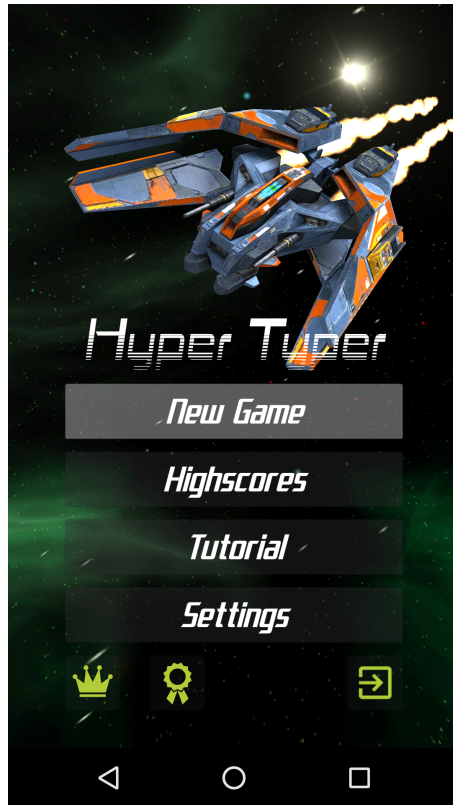
Figure 1: Screenshot of Hyper Typer main menu