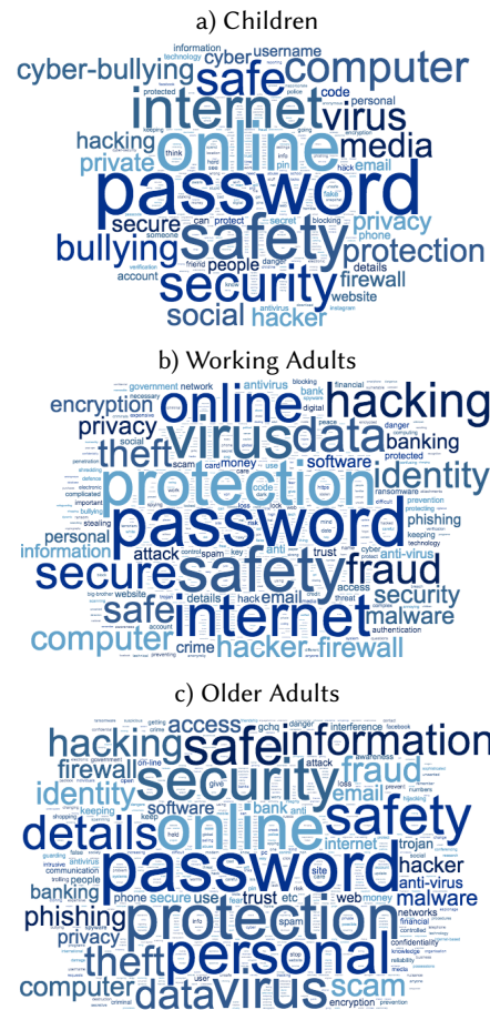
Figure 1: Word clouds for the most frequently listed features of cyber security for each of the three life stages. Larger items indicate more frequent features.

and other personal information on social media sites [2]. Older adults are less likely to adopt PIN or biometric protections for their devices [4], and have been found to be more susceptible to reciprocity-based weapons of influence , whereby adversaries offer rewards for compromising security [8] (e.g. installing malware when lured with a free gift). Older adults have also been found to engage in fewer privacy-related behaviours on social networking sites, but also disclose less information online, and express more concern about other people’s privacy, than younger age groups [5].