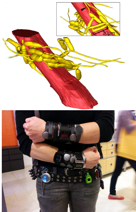
Sidebar 1: Top, fungal filaments surround an ant's mandible muscle [16]. Bottom, commercial sensing devices decorate the wrists of an enthusiastic self-tracker [14].

a twig and bite into it. Once affixed to the twig, the fungus paralyzes the ant, using its body as a breeding ground (Figure 1).