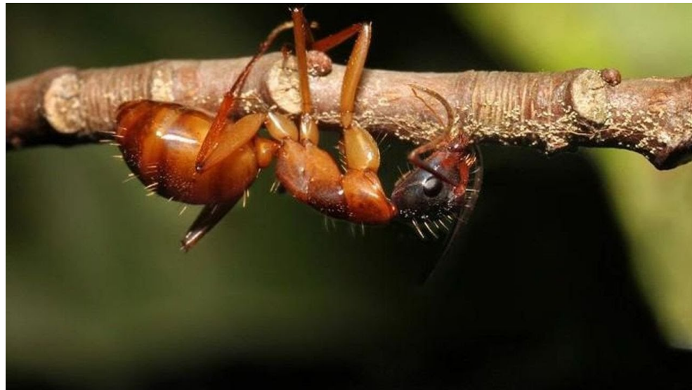
Figure 1: Ophiocordyceps unilateralis sensu lato takes control of an ant's mind, without input from its brain. By constructing a network of sensors and actuators atop its muscles, the fungal complex forces the ant to chew on the underside of a twig, after which the ant's body will serve as a medium for fungal reproduction.

Consider the ant. The fungal complex Ophiocordyceps unilateralis sensu lato overtakes the ant's behavior without acting on its brain at all. Instead, it uses the ant's body to navigate the world, constructing a network of coordinated sensing and actuation atop the ant's muscles [16]. By sensing the ant's environment and stimulating its muscles in response, it causes the ant to crawl beneath