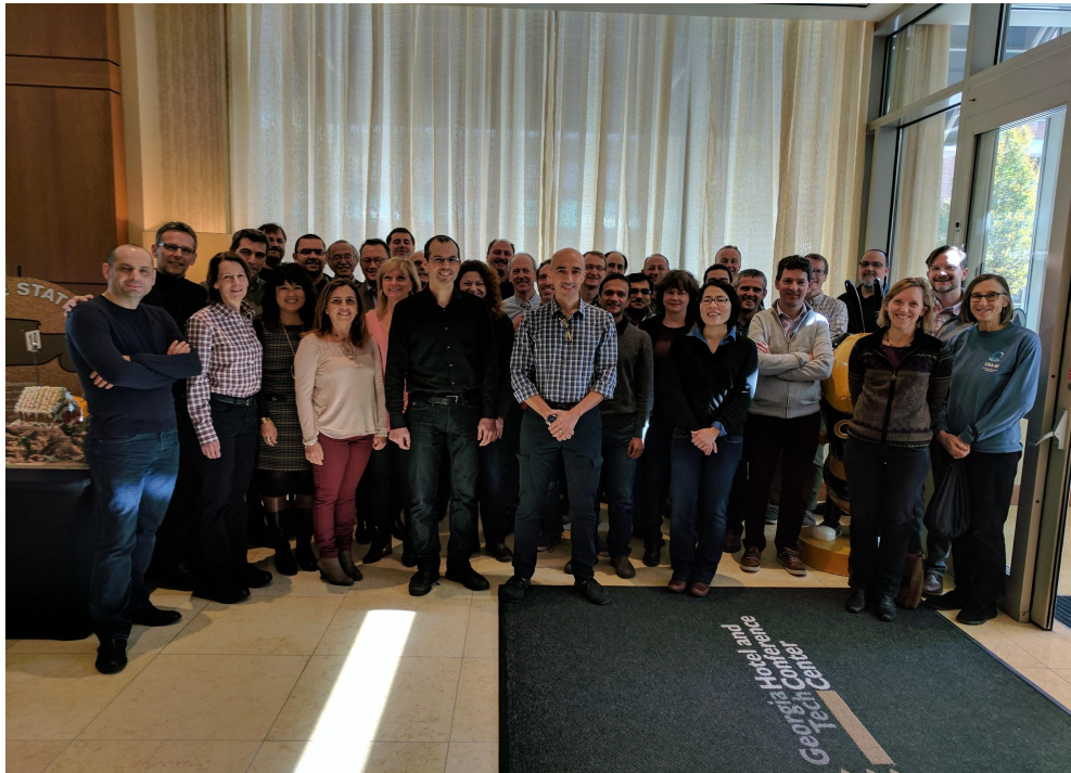
PB Members of ICSE 2017.

The Research Track received 415 submissions from over 1200 authors and 46 countries. To select the papers to be presented among these submissions, we used a Program Board (PB) model, in which a Program Committee (PC) of 93 members reviewed submissions in a first round, followed by a month-long discussion period overseen by the 33 PB members. This phase resulted in 217 submissions being rejected and 18 accepted. In the next phase, the PB members reviewed the 180 undecided submissions, which resulted in 49 additional rejections and 7 additional acceptances. Finally, the PB discussed the 97 remaining submissions during a two-day in-person meeting that took place on December 8-9, 2016 in Atlanta, GA, USA (see picture below). The discussion led to 38 additional acceptances, for a total of 68 accepted papers and an acceptance rate of 16%. Overall, the reviewing team submitted over 1300 reviews, and each submission received 3 (218 submissions), 4 (152 submissions), 5 (17 submissions), or 6 (1 submission) reviews. The PB members overseeing the discussions also wrote a summary of the decisions, which the authors received as feedback, together with their reviews. Based on the reviews of the PC and PB members, the program chairs selected 6 of the 68 accepted papers to receive an ACM SIGSOFT Distinguished Paper Award.